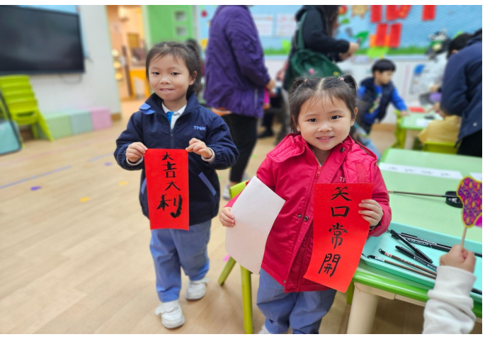
Kindergarten Education Scheme School-based Learning Activity of Chinese Culture